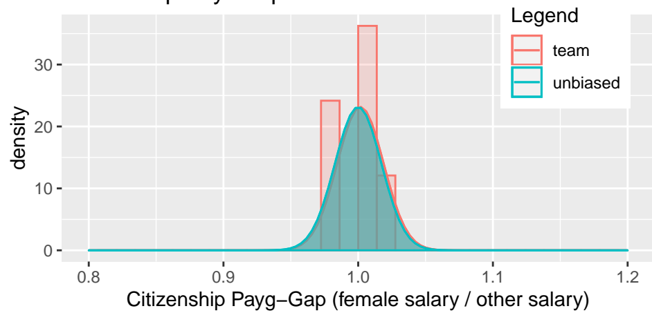
Citizenship Pay-Gap Distribution

No Bias detected for Citizenship (in salary)