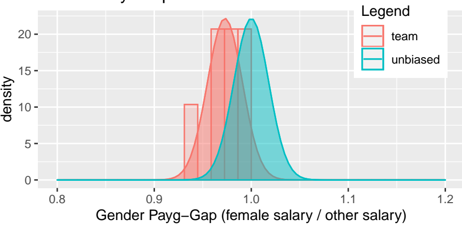
Gender Pay-Gap Distribution

No Bias detected for Citizenship (in salary)